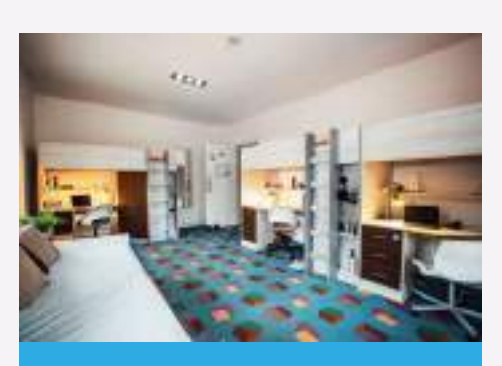
High-quality accommodation facilities