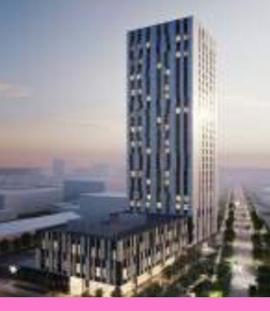
The HUB Student Residence 2416 16 Ave NW, Calgary AB T2M 5C7

Transfer prices can include up to 2 people per vehicle same flight and address