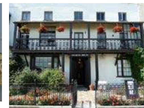
Dickens House Museum