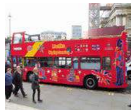
London hop on hop off bus