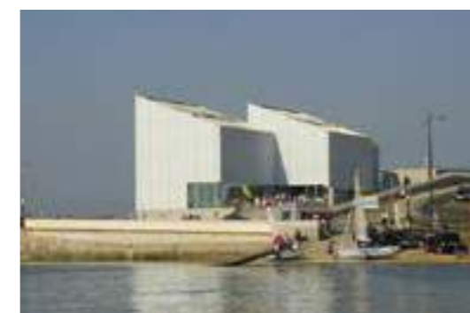
The Turner Contemporary Art Gallery